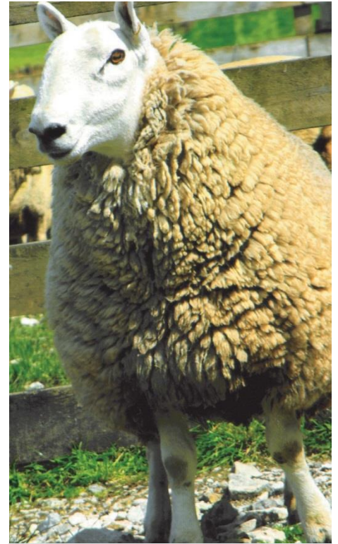
A cheviot ram looking for some ewes

The hoggets are mated a month after the main flock ewes and begin lambing in mid September. Priority is given to getting the hoggets back into condition and up to weight for mating again as 2 toothers. This